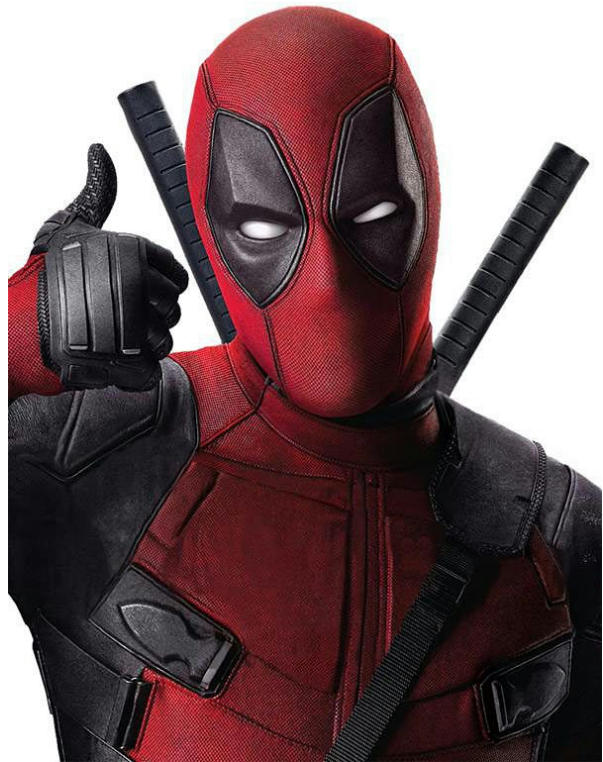
The Merc with a Mouth

Deadpool is everything a fan could have ever wanted, and still manages to be a fun time for those who don't know the character. It's R-rated, but the film would not be the same had it not been able to show us the true raunch and crudeness that Deadpool possesses. From every fourth wall break, to the fast-paced action, to the charming story revolving around Wade and Vanessa's obscure romance, Deadpool is a complete thrill ride from start to finish. It is a good time for fans who likes to just sit back and acknowledge that they are watching yet another superhero movie.