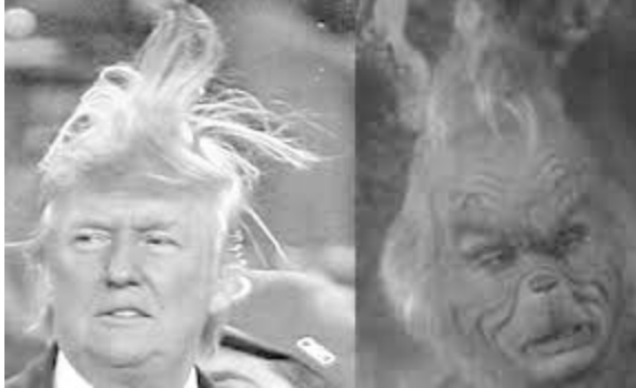
When u got dat' instagram filter just perf

I am not celebrating Christmas this year, But I ask you to grant me one wish. I ask you to give the world peace, Not some fancy edible dish. I cannot seem to celebrate, When all I can see is sadness and hate. I cannot seem to eat Christmas dinner, When people are hungry and cold from the winter. I cannot seem to sing the carols this year, When death is caused by words loud and clear. I cannot seem to unwrap that present, When some still seem to be in the Dark Ages as peasants, I cannot hang up those Christmas lights, When some still sleep with fear at night. How can I celebrate, When people are locked in this horrible fate, This is not a happy date, When all I see are signs of hate. I ask you, God, to stop this misery, For I cannot wait anymore. Because Christmas should be a celebration not just for the rich, But also the poor. Christmas will not be happy this year, Until I stop seeing those black death tears, I won't be happy, The carolers won't be pleased. Because the season isn't really jolly,