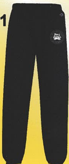
Champion Pants elastic cuffs - NO pockets