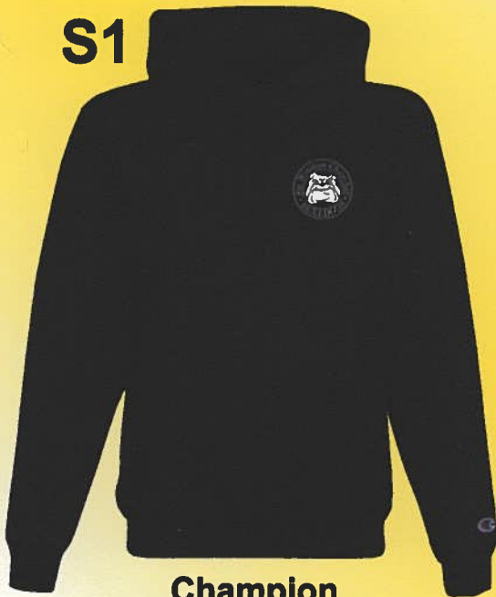
Champion navy heather - embroidered $55