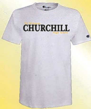
champion t-shirt $15