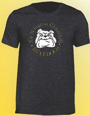
softstyle t-shirt $15