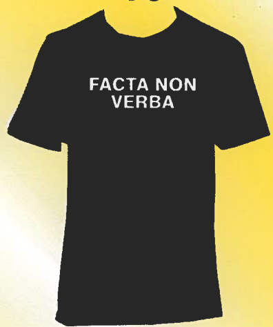
dry-fit t-shirt $15